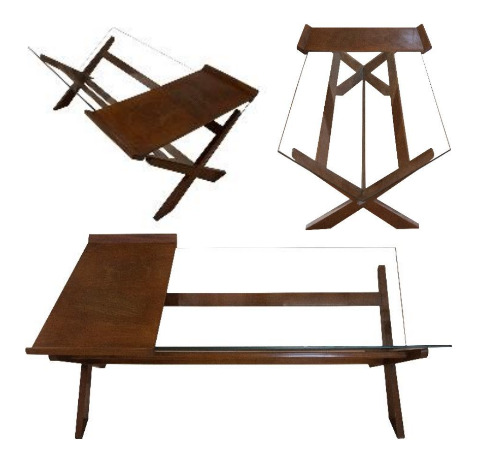
Figure 2. Grand National Assembly of Turkey, newspaper stand and coffee table, inspired by the "rahle" (holy book holder in Islam), 1960s, designed by Gazanfer Erim; in (Tuna Ultav, Z., Hasırcı, D., Borvalı, S., & Atmaca, H., 2016; DATUMM).

the hardships and challenges that the war had brought (Hasirci and Tuna Ultav, 2019). Atatürk, wished the third GNAT building (to be completed and opened in 1961), to reflect the ideals of a modern, secular, and powerful nation, and the finely crafted main building that still houses interior components drawn at the 1/1 detail scale successfully fulfill this aim. The interiors of the GNAT followed this ambition and could be defined as modern in its truest sense, being designed through a competition, having selected the best of modern Turkish interior designers, artists, and architects of the day. Carrying both cultural qualities and international style features, the interiors and furniture showcase an interpretation of modernist features as well as, for instance, making use of traditional kilim patterns on the walls, utilizing local textures on the floors as inspiration, and using the religious "rahle" (holy book holder in Islam) (Figure 2).