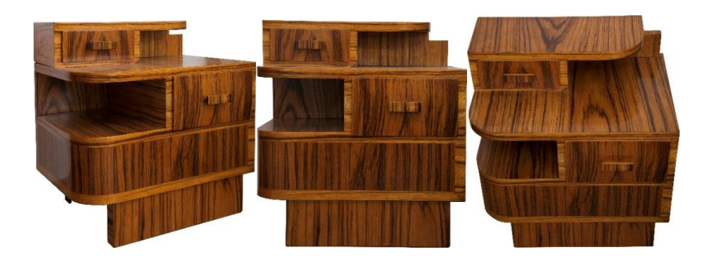
Figure 3 . A detailed look at the sideboard designed by Fazıl Aysu and Seyfi Arkan for the Florya Atatürk Marine Mansion, 1930s (Tuna Ultav, Z., Hasırcı, D., Borvalı, S., & Atmaca, H., 2016; DATUMM).

follow his example (Başbuğ, 2023). Therefore, he showed utmost significance to the interiors he was photographed in. Often photographed at his desk, reading or working, his spaces were modern, sleek, and undecorated, leading the way on what public and private spaces needed to look like in modern Turkey. An analysis of the interiors Atatürk lived and worked in, especially after the Republic, shows a shift from the more decorated interior furnishings of the pre-republican era to the more stylized, and what can be defined as modern. The modern interior also involved novel spaces like the new trains or seaside mansions such as Florya Atatürk Sea Mansion, that required minimal and concise design and clever detail solutions, in a unified design language and quality craftsmanship, not only with new styles but also incorporating new materials. Since as head of state and leader of the modern revolution, Atatürk's furniture is expected to reflect some of the utmost progressive criteria, it is quite rewarding to investigate photos of interior and exterior spaces that frequently display aspects of furniture (Figures 3, 4, and 5).