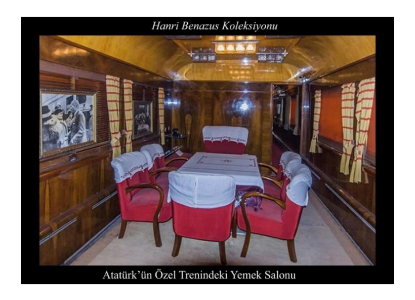
Figure 4. Information on form, material, texture, and textiles can be derived from Atatürk and his wife Latife Hanım's photographs and interiors depicting a variety of contemporary modern furniture.